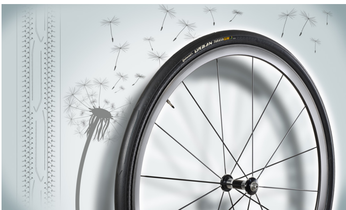
Der Urban Taraxagum von Continental ist der erste in Serie gefertigte Fahrradreifen aus Löwenzahn-Kautschuk.