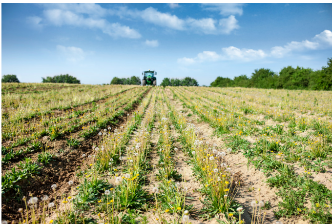
Naturkautschuk aus Löwenzahn zeigt, dass eine neue, alternative sowie nachhaltige Rohstoffversorgung möglich ist.