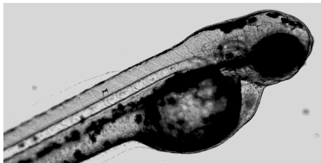
Danio rerio model organism.

Pesticides, biocides or pharmaceuticals can display adverse effects in non-target organisms. This may threaten populations with far-reaching consequences for the ecosystem. Therefore, European legislation requires manufacturers to provide data for environmental risk assessment of active substances for registration. The commonly applied OECD tests are time and cost-consuming and utilize a substantial number of animals. Thus, they are conducted only in the final stage of substance development, bearing the risk of failing registration due to adverse environmental effects. The Eco'n'OMICs project aims at an early ecotoxicological risk prediction for development compound classes based on their induced molecular changes in aquatic model organisms. We apply OMICs to identify gene expression changes as molecular biomarkers for a number of ecotoxicologically well characterized model substances covering a broad range of modes-of-action (MoA).