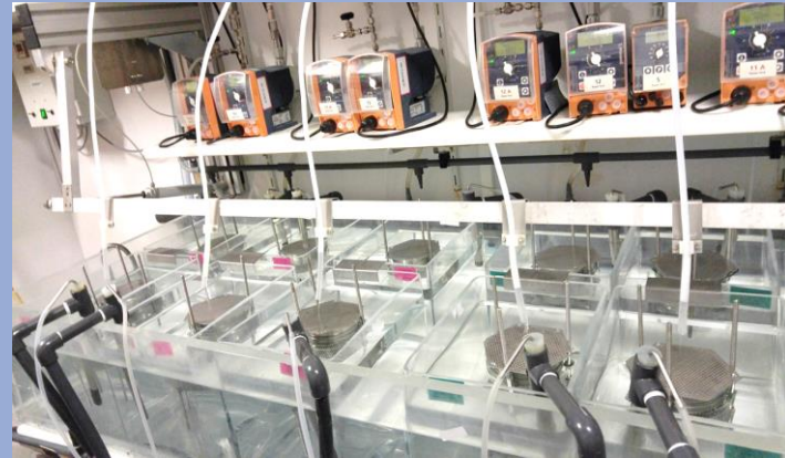
Figure 1: Flow through setup, including exposure and transfer vessels

In contrast to a continuous exposure, the procedure of several pulse applications may have an impact and possible impairment of the sensitive stages. However, it was demonstrated that the performance of the life stages exposed was acceptable and conforms to quality criteria set by the test guidelines (OECD, USEPA). The test design was shown to provide a suitable approach to address a very complex exposure regime to cover the ‘worst case’ when a typical laboratory exposure is unrealistic.