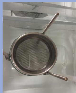
Figure 3: Chamber to keep and transfer fish larvae and alevins